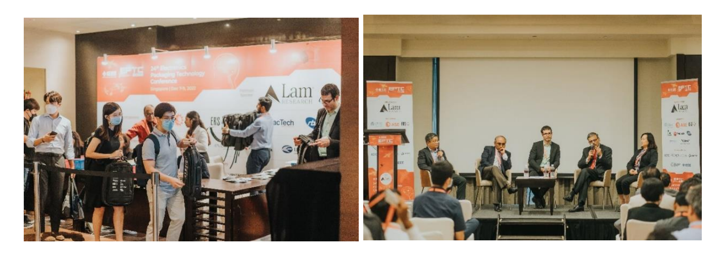
EPTC 2023 : Sponsors Booth Arrangement